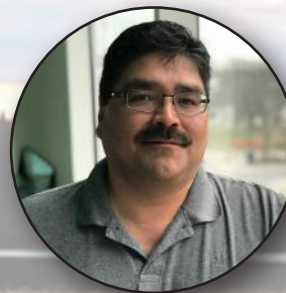
Leslie Dysart Community Association of South Indian Lake